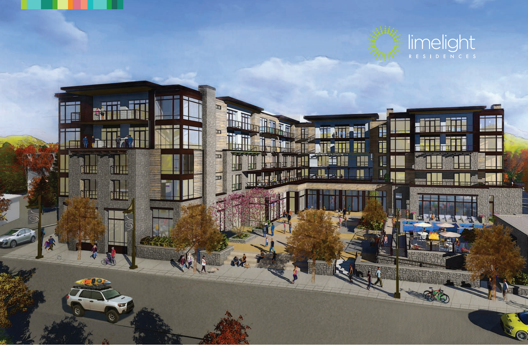
The renderings shown in this brochure are visualizations of preliminary design concepts and are subject to change without notice. Developer is under no obligation to construct or use any of the concepts, materials or design details shown. Please obtain the property report or its equivalent as required by federal or state law and carefully read it before signing anything. This is not an offer or solicitation in any state in which the legal requirements for such offering have not been met. Warning: the California Department of Real Estate has not inspected, examined or qualified this offering. © 2015, Aspen Skiing Company and Limelight. Limelight name and marks are the trademarks of Aspen Skiing Company LLC. Designated copyrighted materials, trademarks, photos, artwork and logos are the property of the respective owners and used pursuant to express agreement.